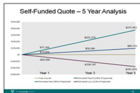
B. Renewal Financial Projections